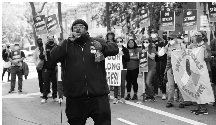
SEIU and OEA solidarity, April 2022

When the union leaders go into bargaining with the administration they lack information on the budget and what the administration is doing, so they are so